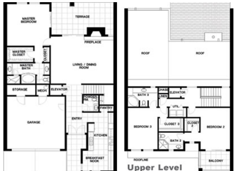
Lot 2 floorplan is reversed, with garage on right.